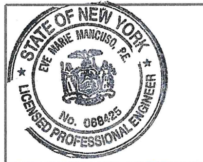
Professional Engineer or Registered Architect Stamp (if applicable)