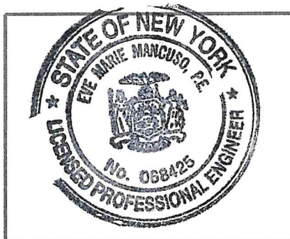
Professional Engineer or Registered Architect Stamp (if applicable)