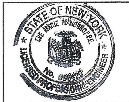
Professional Engineer or Registered Architect Stamp (if applicable)