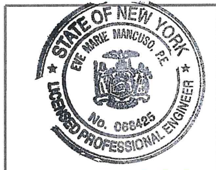
Professional Engineer or Registered Architect Stamp (if applicable)